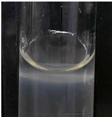
Figure 1: Dinger's Disk