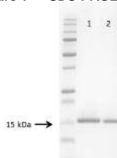
Figure 1 — SDS-PAGE of CS3

Lane 1: Purified CS3 (5 µg) Lane 2: Purified CS3 (2.5 µg)