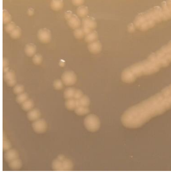
Figure 1: Colony Morphology