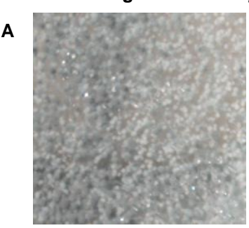
Figure 1: Colony and Conidial Morphology