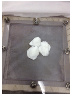
Cotton Pads on top of Holding Cage