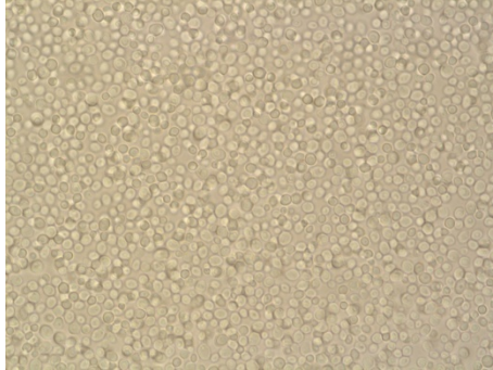
Figure 1a: Cellular Morphology