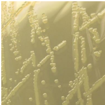
Figure 1: Colony Morphology