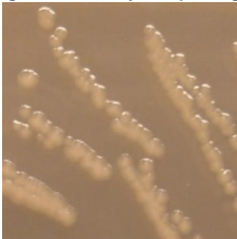
Figure 1: Colony Morphology