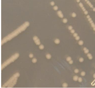
Figure 1: Colony Morphology