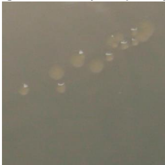
Figure 1: Colony Morphology