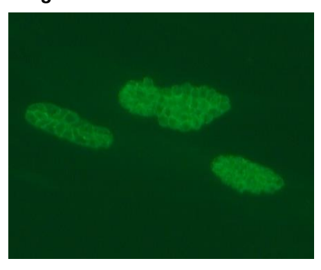
Figure 2: Immunofluorescence Assay of T. gondii Infected Fibroblast Cells